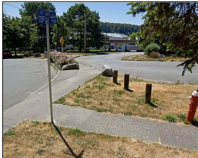
11Page 43 of 112

A diagonal diverter is a raised barrier placed diagonally across an intersection that forces traffic to turn and prevents traffic from proceeding straight through the intersection. Diverters can incorporate gaps for pedestrians, wheelchairs and bicycles and can be mountable by emergency vehicles.