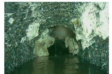
FOG accumulation on pipe walls