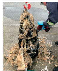
FOG accumulation on pump