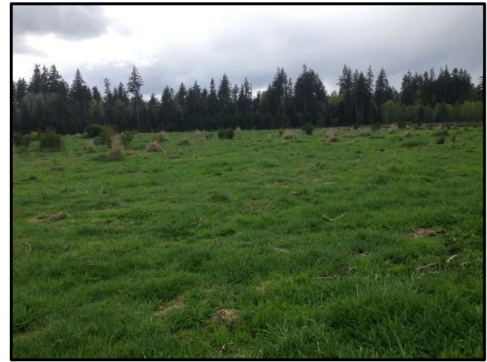
Photograph 1: The Norm Wood Environmental Centre Field 2 in the City of Campbell River. (April, 2015)