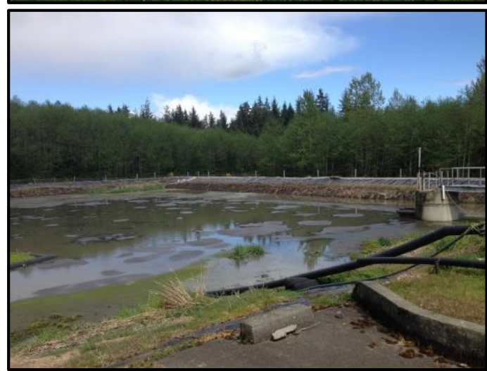
Photograph 2: A poly-lined storage lagoon at the City of Campbell River's Norm Wood Environmental Centre wastewater treatment plant. (April, 2015)