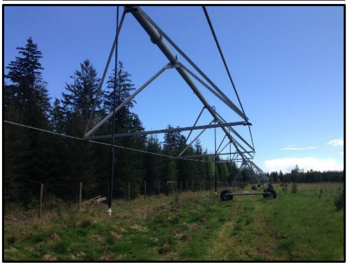
Photograph 3: An irrigation pivot used to land-apply liquid biosolids from the Norm Wood Environmental Centre. (April, 2015)