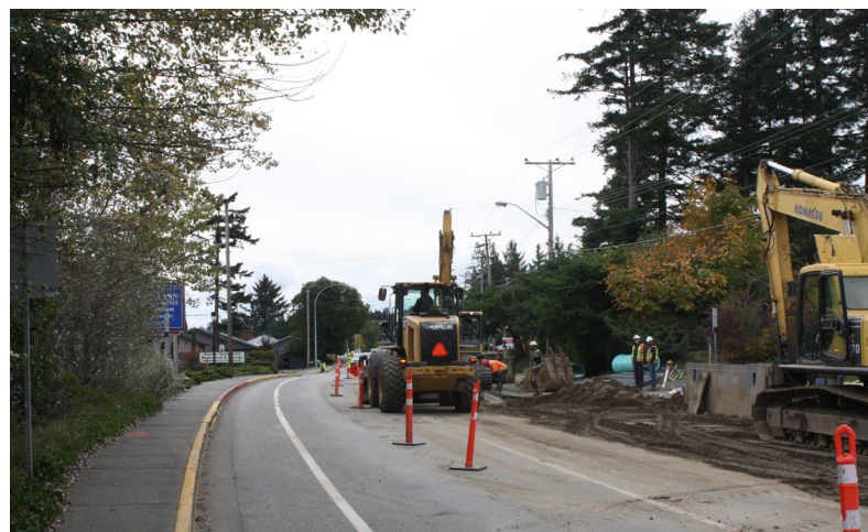
Construction progressing along Hwy 19A in Oct. 2018

Drop in any time – come & go as you are able!