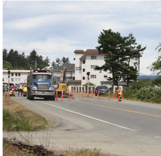
Crews preparing the highway/laydown area for work this summer.

We understand this work will be disruptive at times, and we are committed to reducing that disruption by sharing regular updates about the work to come. Watch for these news bulletins (to be provided monthly) and updates on social media, the project's webpage, radio notices and signage.