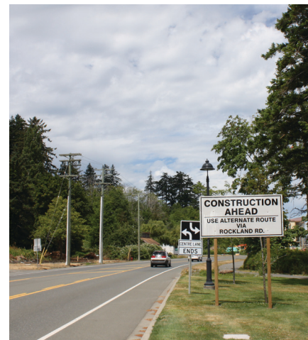
Watch for directional signage along Hwy 19A.

In the active work zone (not the full construction zone) there will be times when the cycling lane is removed, either for space or because the asphalt is removed. In those circumstances, cyclists may be asked to dismount and reroute around those areas. Please follow direction of traffic control and signage.