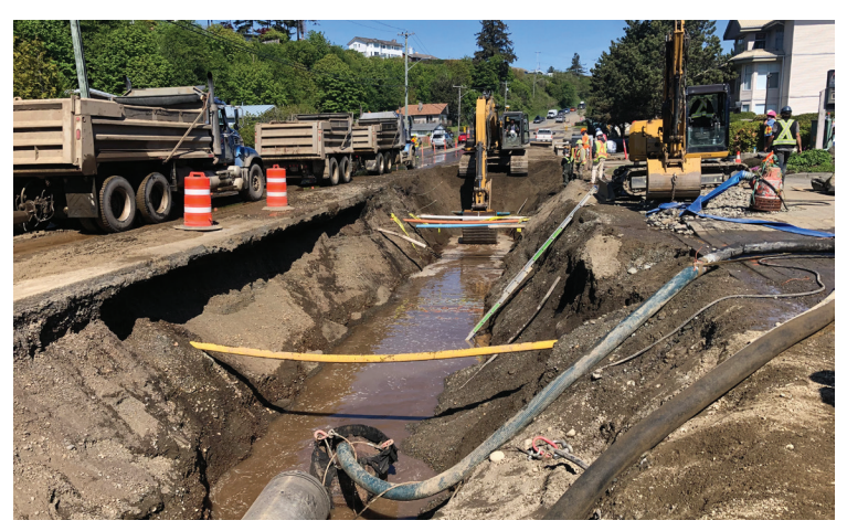
The open trench is prepared for the new sewer pipe to be installed.

The construction work this summer will be intensive, with large trenches disrupting traffic flow. If possible, choose an alternative route. Drivers should expect slow flow, and single-lane alternating traffic stops to the end of 2020.