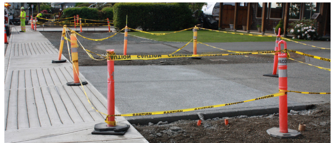
Finishing concrete work is an important part of the final property restorations.