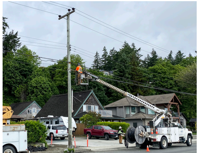
Crews work to remove telecommunications lines from the overhead poles.

Watch the City's websites, social media accounts, and these newsletters for continued updates in the coming months.