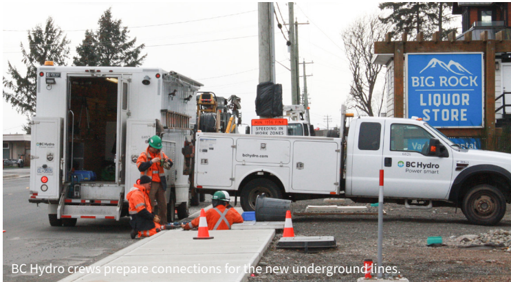
BC Hydro crews prepare connections for the new underground lines.